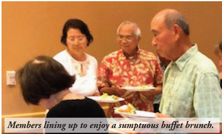
Members lining up to enjoy a sumptuous buffet brunch.